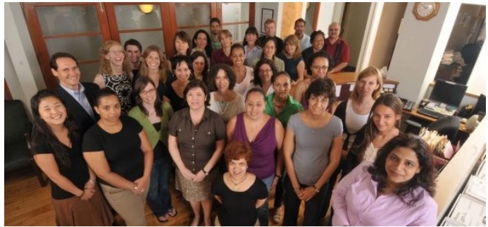
The welcoming staff at New York Lawyers for the Public Interest

With bright smiles and gift bags in hand, the students left the visit to Colgate-Palmolive happy and inspired.