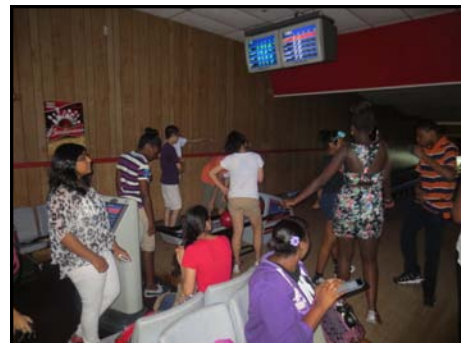
Having a "Fun Day" at Astoria Bowl in Queens, NY.

"The SLI program helped me build confidence... criminal law is something everyone should learn."