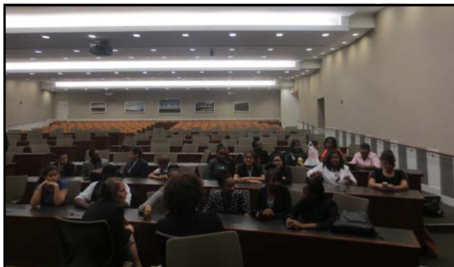
Getting Ready for the Mock Trial Finals at NYLS