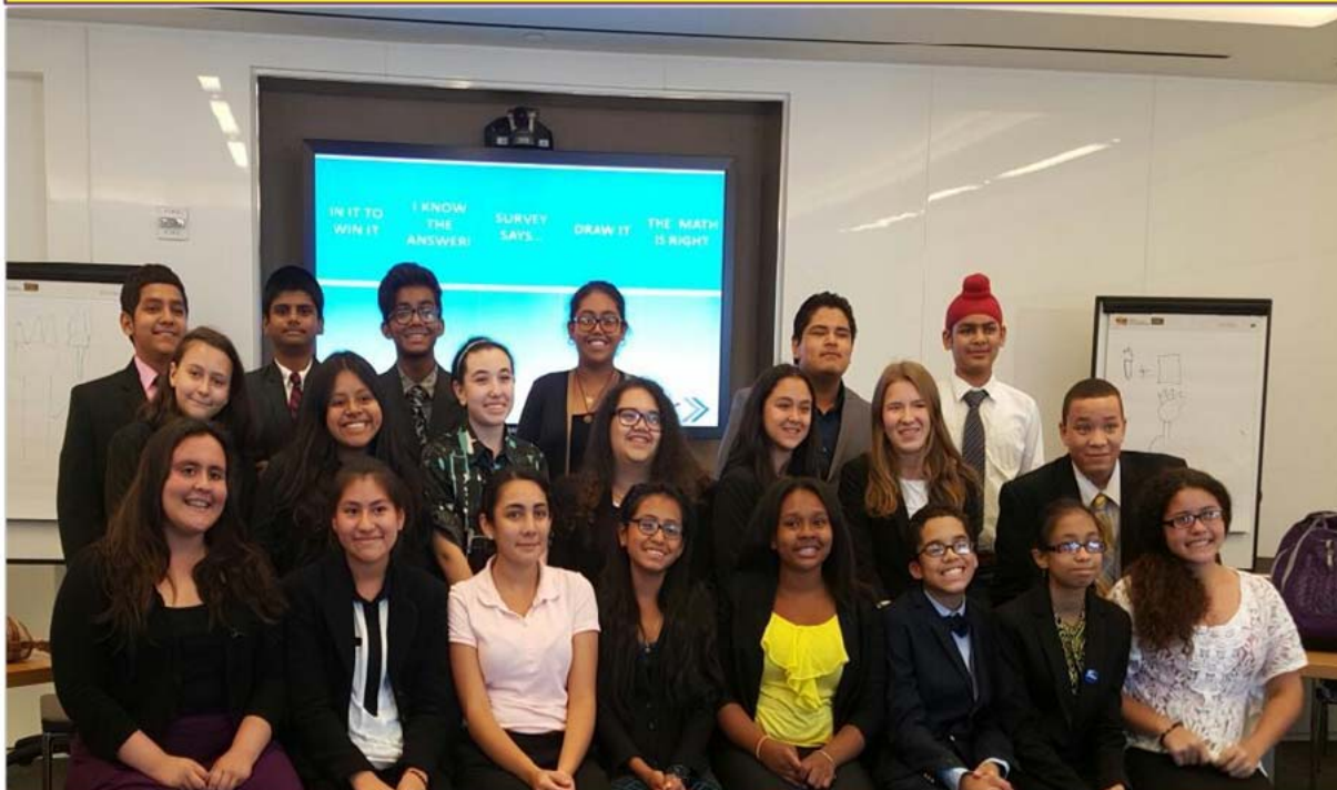
CUNY SLI 2015 Students at Proskauer Rose