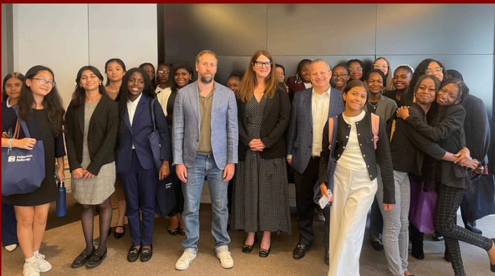
Pictured: Students at Patterson Belknap Webb & Tyler LLP

Our students started to build their sense of professionalism through weekly field trips to prestigious law firms and legal institutions. These institutions provided mock legal activities that pushed students to utilize their knowledge of the law in unique new ways.