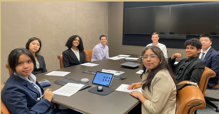
Pictured: Students at Proskauer Rose LLP

Our students started to build their sense of professionalism through weekly field trips to prestigious law firms and legal institutions. These institutions provided mock legal activities that pushed students to utilize their knowledge of the law in unique new ways.