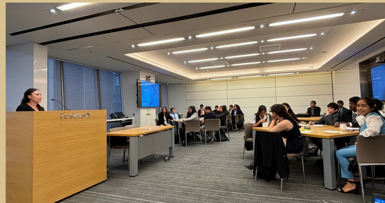
Pictured: Students with an LO Alumna from Proskauer Rose LLP

Every Monday through Thursday over the summer our classroom was graced with visits from attorney guest speakers. Thank you for helping expand our students' visions for their futures!