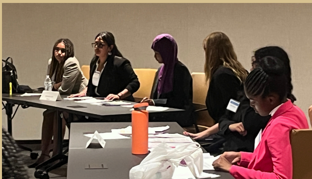
Pictured: Students at Simpson Thacher & Bartlett LLP

Our students started to build their sense of professionalism through weekly field trips to prestigious law firms and legal institutions. These institutions provided mock legal activities that pushed students to utilize their knowledge of the law in unique new ways.