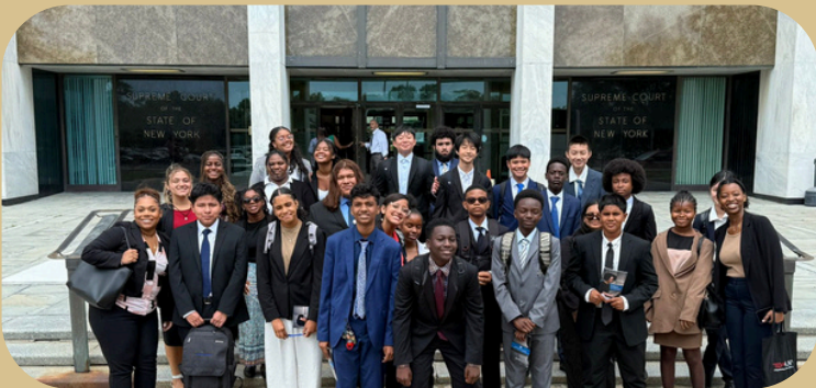
Pictured: Students at the Nassau County Courthouse

Our students started to build their sense of professionalism through weekly field trips to prestigious law firms and legal institutions. These institutions dissected for their young visitors their contributions to the legal profession, prepared tours and a mock negotiation activity, and provided the students with the opportunity to sit in on a trial and participate in a jury selection exercise. To our field trip hosts, thank you for being attentive to our students and for planning wonderful experiences!